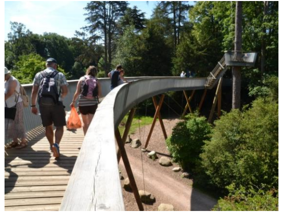
Westonbirt's Treetop Walkway

The nearby Westonbirt Arboretum is in Gloucestershire, about 3 miles southwest of the town of Tetbury. Managed by the Forestry Commission, it was planted in the heyday of Victorian plant hunting in the mid-19th century as part of the Westonbirt House estate which is Grade 1 listed among Historic Parks and Gardens of special historic interest.